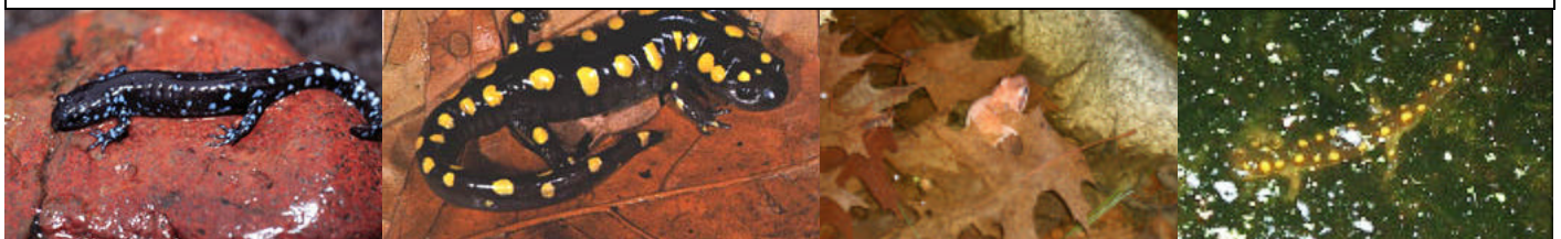
Blue Spotted Salamander.....Yellow Spotted Salamander.....Wood Frog.....OH MY!!

For more information on vernal pools, take a look at the Reading Memorial High School's Vernal Pool Association website at www.vernalpool.org