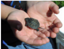
Baby Spotted Turtle in Westford