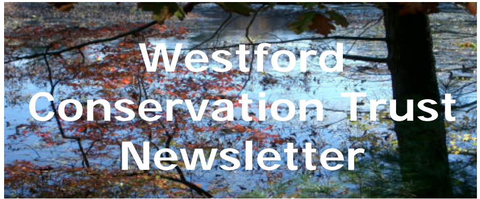
Stony Brook at East Boston Camps