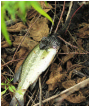
Northern water snake eating an 8-inch bass at Nashoba Pond.