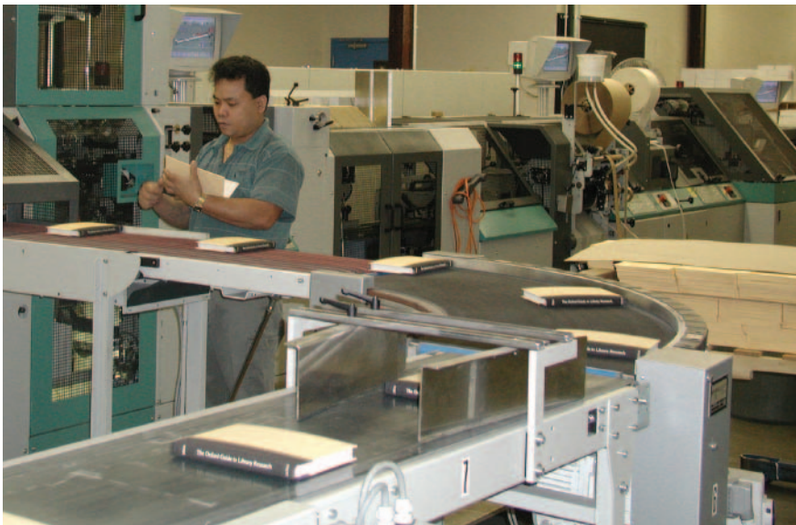
Of the 27 million books that Courier Westford manufactures each year, more than seven million are casebound.